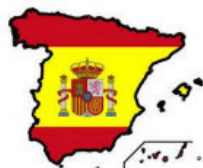
IES LA GRANJA Jerez de la Frontera Spania