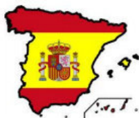
IES LA GRANJA Jerez de la Frontera Spania