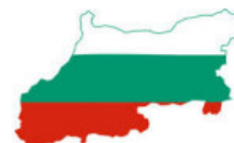
PRIVATE HIGH SCHOOL IN TOURISM AND ENTREPRENEURSHIP „Rayko Tsonchev”, Dobrich, Bulgaria