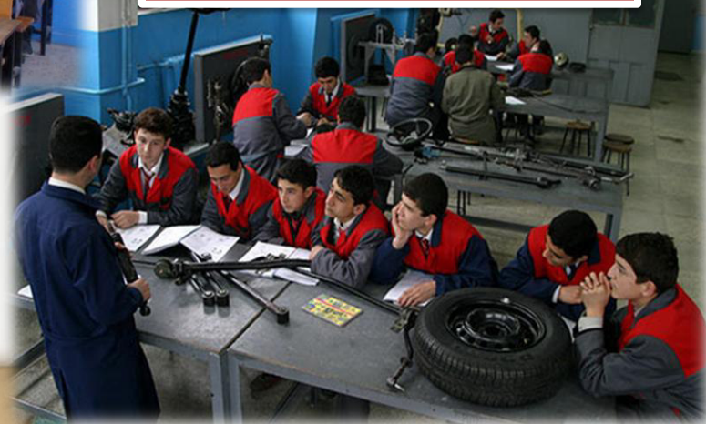
Vocational High School