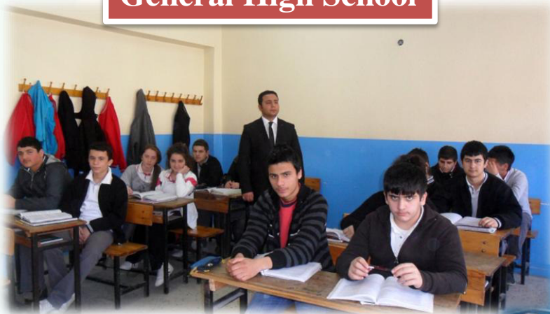
General High School