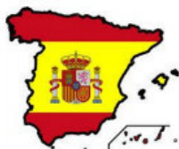
IES LA GRANJA Jerez de la Frontera Spania