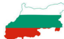
PRIVATE HIGH SCHOOL IN TOURISM AND ENTREPRENEURSHIP „Rayko Tsonchev”, Dobrich, Bulgaria