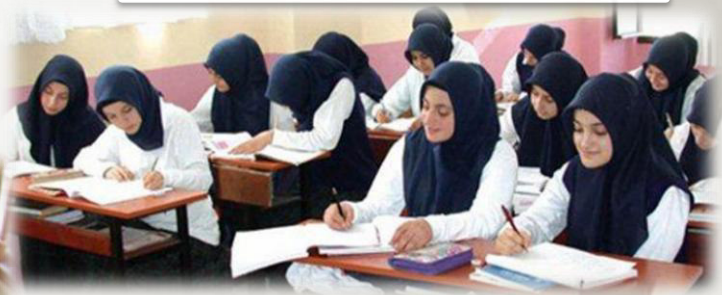
Religious High School