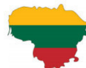
BIRZU RAJANO PABIRZES PAGRINDINE MOKYKLA Pabirze, Lituania