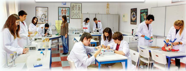
Science High School