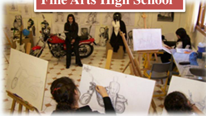
Fine Arts High School