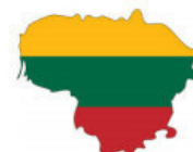
BIRZU RAJANO PABIRZES PAGRINDINE MOKYKLA Pabirze, Lituania