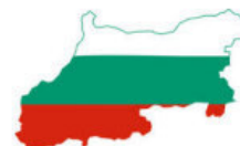
PRIVATE HIGH SCHOOL IN TOURISM AND ENTREPRENEURSHIP „Rayko Tsonchev”, Dobrich, Bulgaria