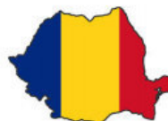
COLEGIUL TEHNIC "Traian Vuia" Oradea , România