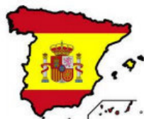
IES LA GRANJA Jerez de la Frontera Spainia